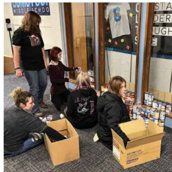
Middle school students pack up canned goods to be donated to the Comstock Community Center.