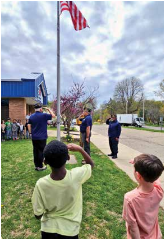
Veterans and STEM Academy students salute the school's new flag donated by American Legion Westnedge Post 36.

The American Legion Westnedge Post 36 recently donated a new American flag to the STEM Academy to replace the old one that was torn and tattered.