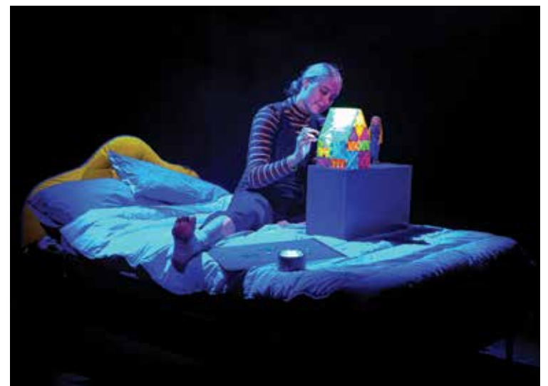
In the show, ZOOOM, performed by Patch Theater at the Community Auditorium, a child, alone in her bedroom and unable to sleep, plays with her house of light before she is immersed inside of it.

A Simple Space sets audiences alight with non-stop feats of unbelievable acrobatic ability and exhilarating human physicality. It is supported by driving live percussion and presented so intimately that you can feel the heat, hear every breath, and be immersed in every moment. The audience is brought in close to surround the stripped-back stage. In that space, the acrobats are pushed to the physical limit, breaking down their usual guards, and introducing the reality of failure and weakness.