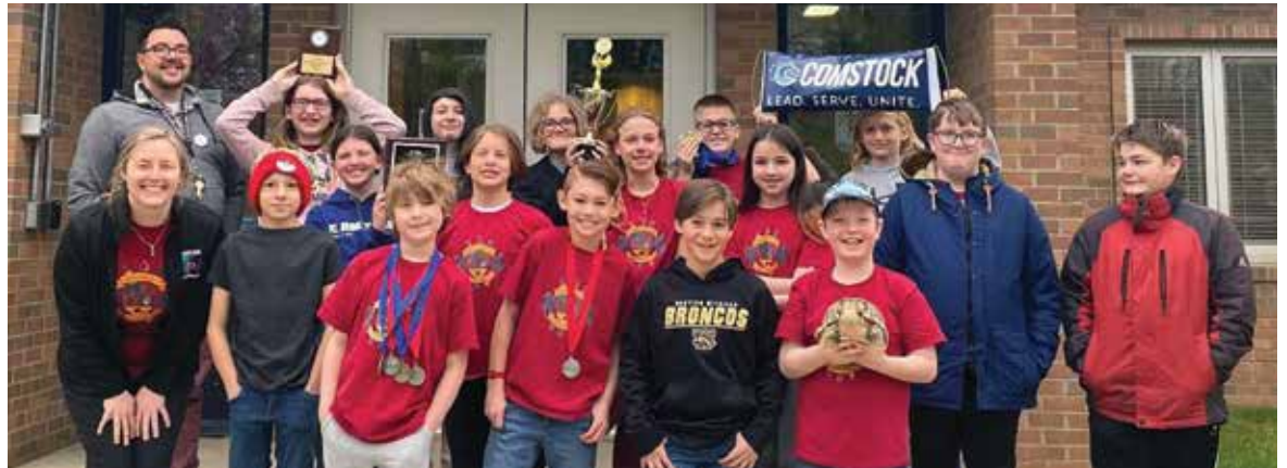
The team celebrates their season by posing at the entrance to the school.

The STEM Academy Science Olympiad Team was named the Division B, Class C State Champions at the Science Olympiad State Championship.