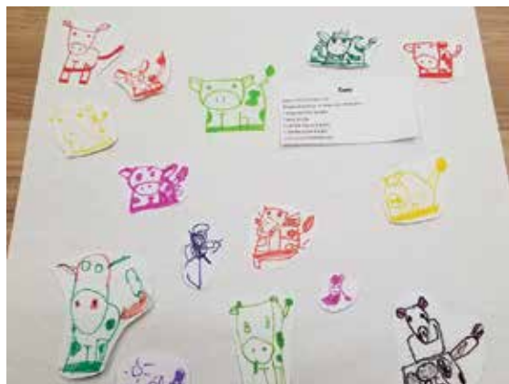
Right: Students illustrated the poem they wrote about a cow.

Students in Y5, kindergarten, first, and second grades wrote an Animal Poem collaboratively and then drew an illustration to go along with the animal.