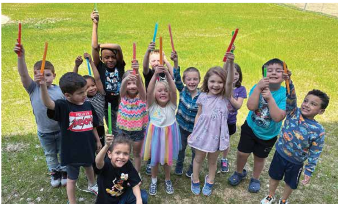
Miss Buscher's class enjoy their popsicles after having achieved their WIG math goals.

The school tracked the whole school's progress on a bulletin board in the hallway. Students celebrated their achievement with a popsicle party outdoors.