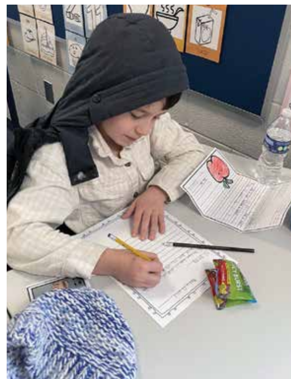
Above and above left: Students enjoy writing letters to and reading letters from their pen pals.