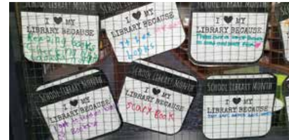
On display for School Library Month were students' hand-written notes on "Why I Love my School Library."