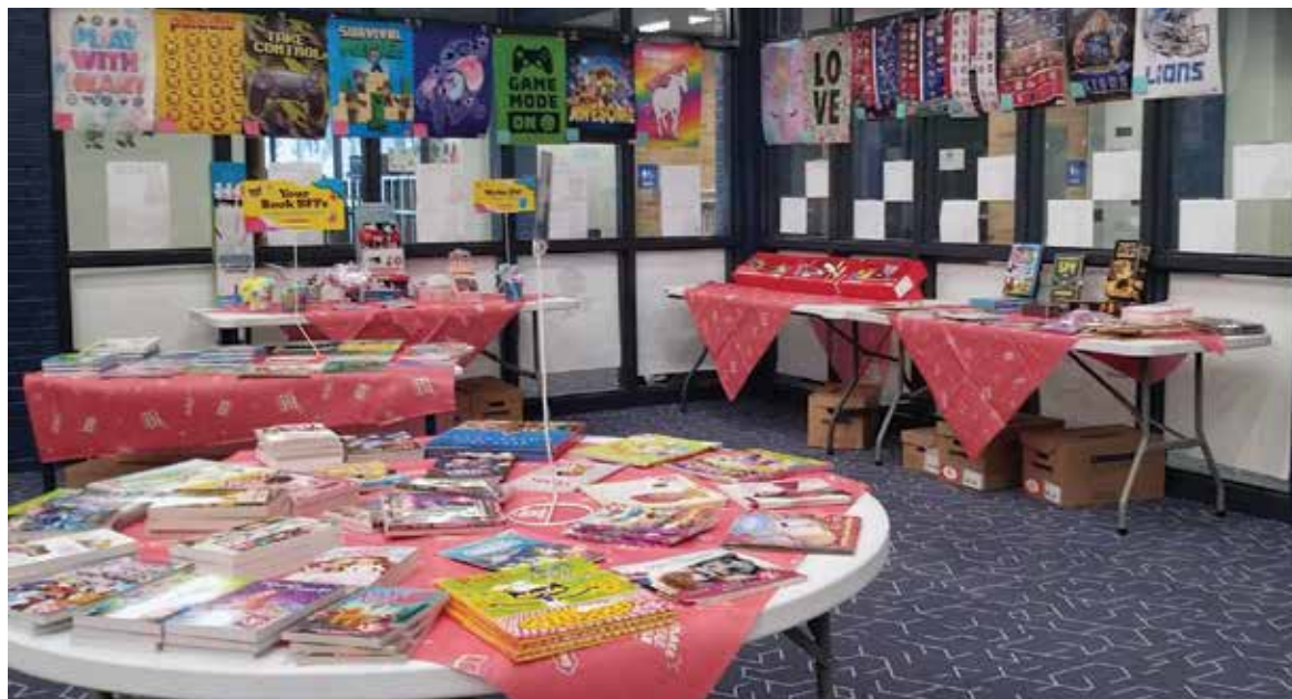
Colorful books fill the tables at the Book Fair, just waiting to get into the hands of eager students.

The CES Library has been able to purchase new books due to the Book Fairs and various donations.