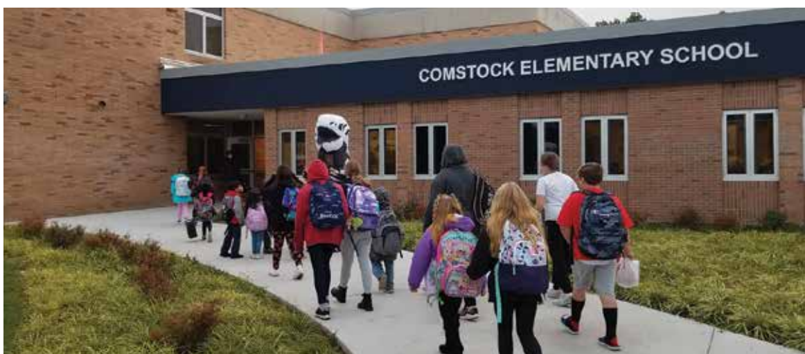
Students were greeted with a Jurassic Hug on the day of the Parade.

Students and teachers dressed up. Families lined the bus loop to see all the wonderful costumes, characters, and some dance moves, too. Later that same day, the high school's National Honor Society and teachers launched a Trunk o' Treat evening. There were many fancy trunks and many treats to be had. It was a grand day of fun and family!