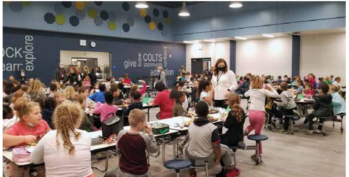
Students and staff eat lunch time for the first time in CES's new cafeteria.

Elementary students ate in their new cafeteria for the first time in November. The week before the opening, teachers discussed with students the expectations about eating in the new cafeteria.