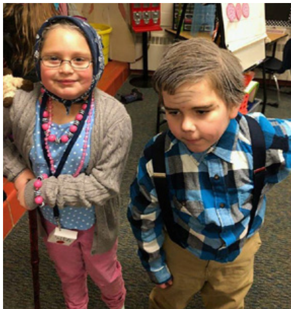
First graders dressed as centenarians.

For the 100th day of school, Green Meadow students and staff celebrated by dressing up as though they were 100 years old – a centenarian.