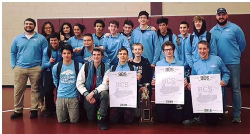
The boys wrestling team won the BCS Conference Title this year, the first wrestling title in Comstock's history.