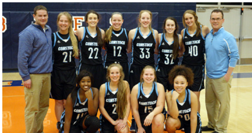
The varsity girls basketball team, winners of the BCS Conference Title.

The spring sports awards banquet will be held on Thursday, June 7, starting at 6:30 p.m. in the auditorium. All spring high school and middle school sports will be invited to attend the banquet.