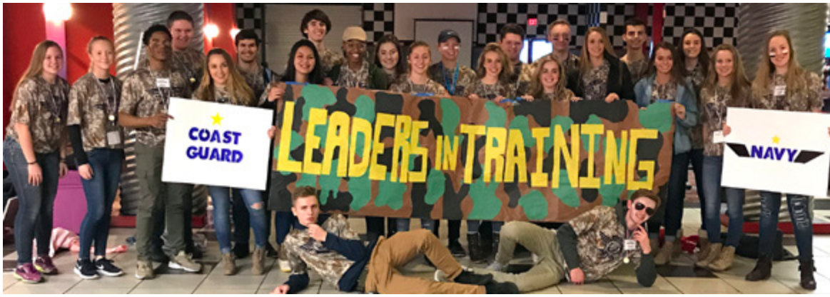
The 2018 National Honor Society hosted their first-ever MASC/MAHS Regional Student Leadership Conference at Craig's Cruisers in Grand Rapids.