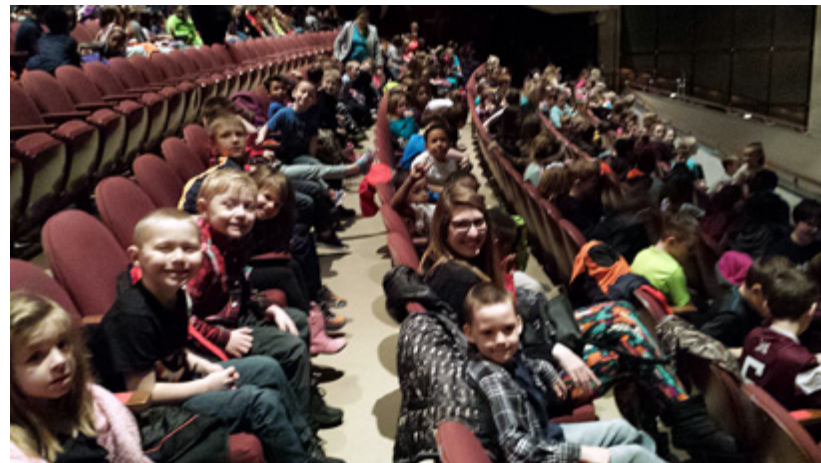
Green Meadow students wait anxiously for the beginning of the show, "Airplay," at Miller Auditorium.

Through the PACE program, elementary and middle school students learn about art forms, explore artistic creations and the creative process, and celebrate their own creative projects.