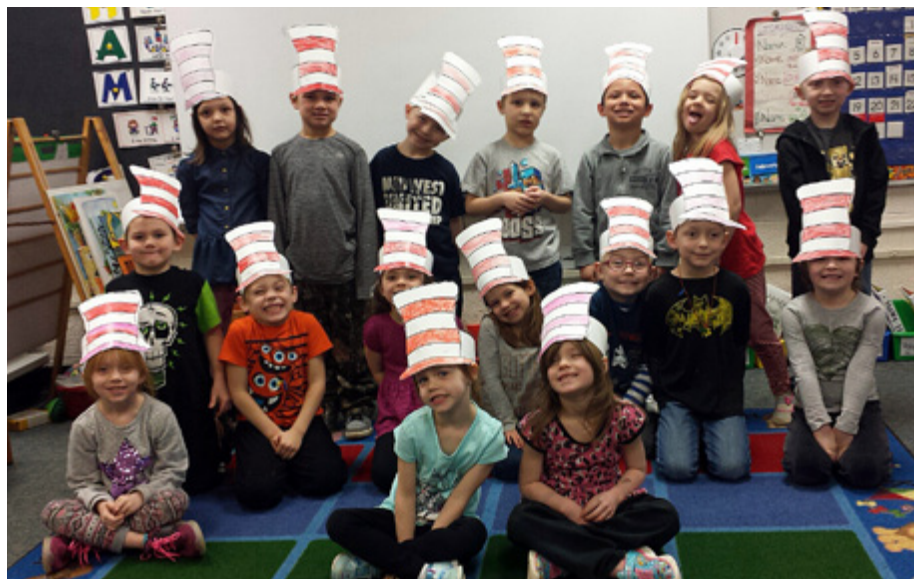
Above: Green Meadow third graders celebrate Dr. Seuss's birthday.

Check up on our celebrations on the Green Meadow Facebook page.