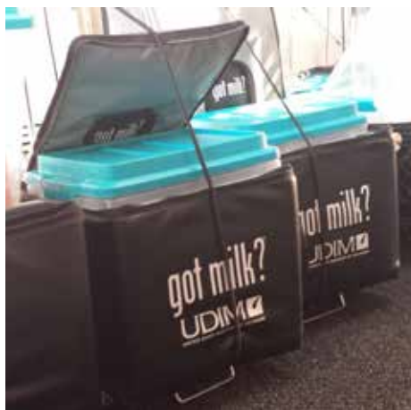
These carts are rolled down to the classrooms every morning for breakfast.

This year Green Meadow Elementary is serving "Breakfast in the Classroom." Breakfast is available to all students without charge. So far, tardies at Green Meadow have declined since implementation of the free breakfasts compared to last year. Students are also enjoying the opportunity to eat in a quieter and cozier setting in the morning.