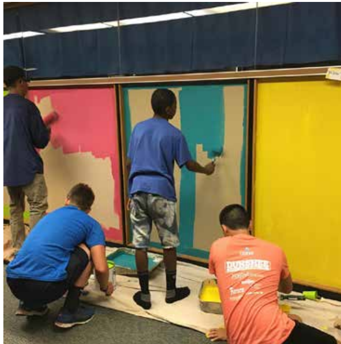
Above: The football team worked hard in Green Meadow's hallways this summer.

This fall, the football team returned to Green Meadow to read with students. Football players and students met up in the "Synergy Space" to read stories together. The high schoolers and elementary students took turns reading to each other. What a great way to synergize across the age levels.