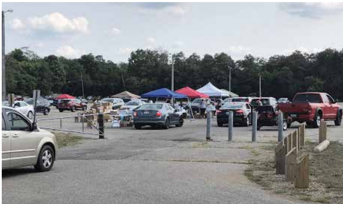
Traffic lines up as families pick up their students' electronic equipment during Tech Distribution Day.

Because the school year was going to begin with an all-virtual format, Comstock staff sponsored a Tech Distribution Day this summer to provide electronic equipment to over 1700 students.