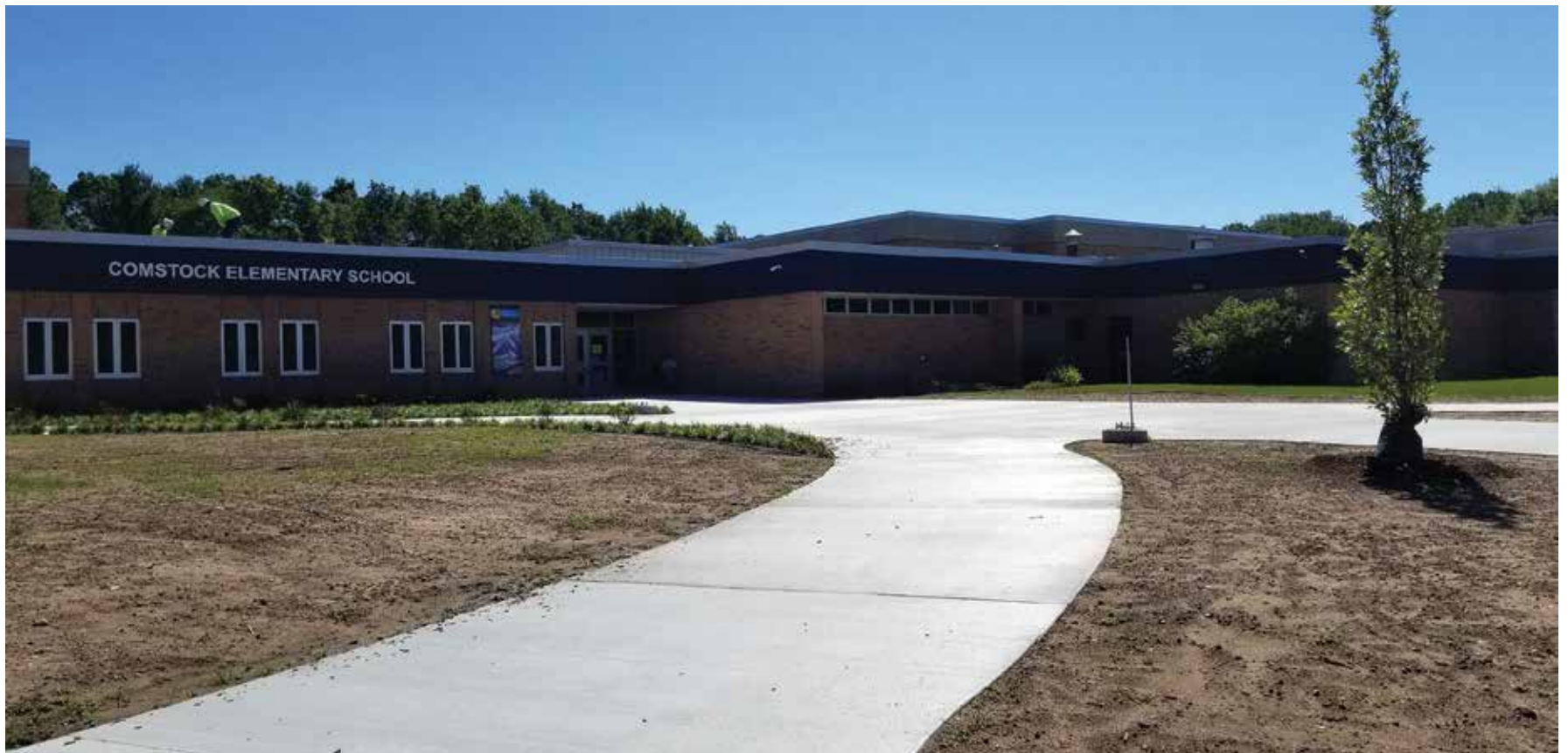
Comstock Elementary School