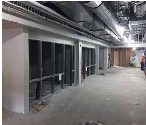
This will be an upstairs classroom and hallway.