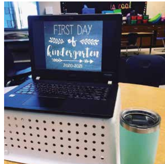
The first day of school was a virtual event.