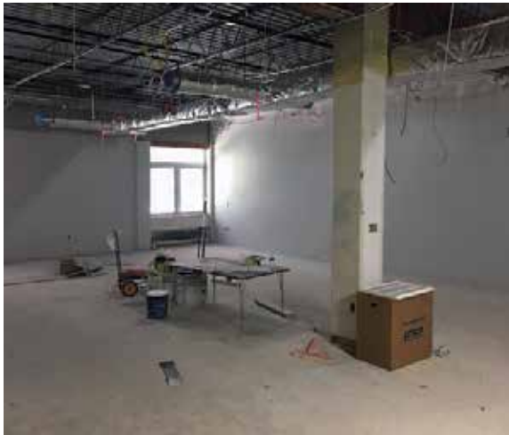
The inside of a future classroom.

While staff can hear the construction and see the workers, they are not allowed to peek inside, but Superintendent Thoenes was able to go in wearing a hardhat to snap these pictures.