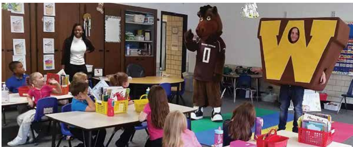
Buster the Bronco from Western Michigan University visited classrooms to encourage students to work hard and dream big.

We look forward to College Awareness Month next year and hope to encourage even more participation.