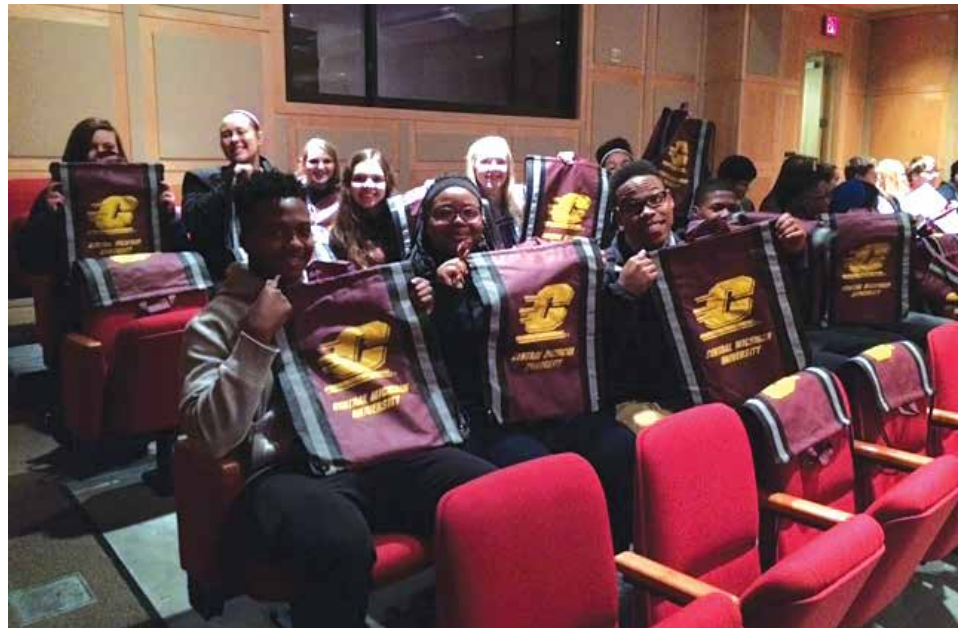
CHS students show off the CMU bags they received on a visit to the Mount Pleasant college campus.

CHS students said the experience was extremely beneficial to their college search and decision making process.