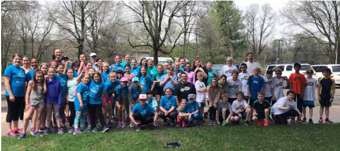
Coaches and Runners gather together before the practice 5K.

STEM Academy runners from the Let Me Run, Heart & Sole, and Girls on the Run teams joined forces this spring to practice for their big 5K run. Supported by their coaches and family members, 65 runners took to the streets of the neighborhood to run.