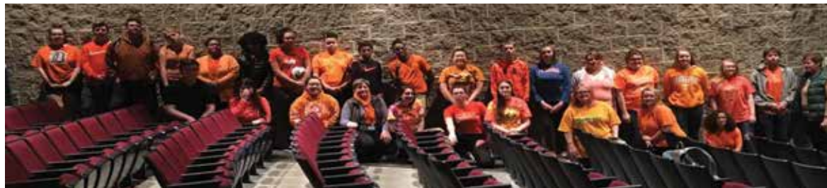
Students staged a walk-in in the high school auditorium in remembrance of the victims of the high school shooting in Parkland, Florida.

While other high schools were staging walkouts in the spring to remember the victims of the school shooting in Parkland, Florida, Comstock's students staged a walk-in. Dressed in orange, the designated color for the national event, students marched into the auditorium.