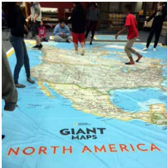
Students learn about North American geography with the help of the Giant Map on loan from the Michigan Geographic Alliance.

A giant map of North America on loan from the Michigan Geographic Alliance helped NEMS students study North American geography.